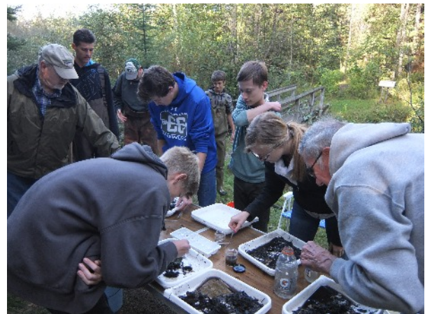
Students Sorting Macro-invertebrates

If you have an interest in this program and would like to volunteer to help out, please contact us by email as shown on the last page or come to next meeting as shown on the first page.