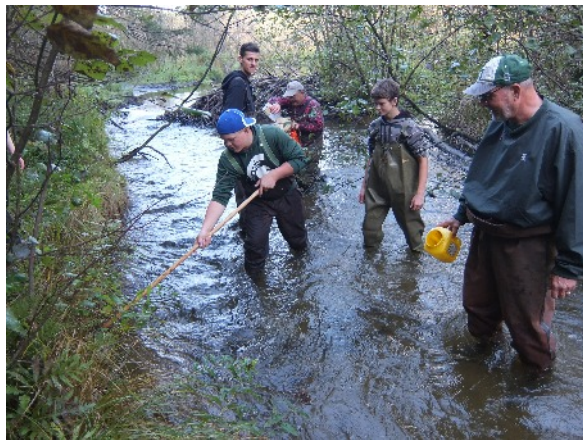
Sampling at the Pine River Campground

For several years now, on an every five year rotation, staff from Michigan Dept of Environment, Great Lakes, and Energy (EGLE), which most of us know as the DEQ and DNR, have been sampling the streams in the Pine River Watershed for aquatic insects, which they then score to indicate the water quality of that stream. PRVEL has been attempting to assist them in their sampling efforts by conducting a similar program annually, involving volunteers from our membership along with high school students.