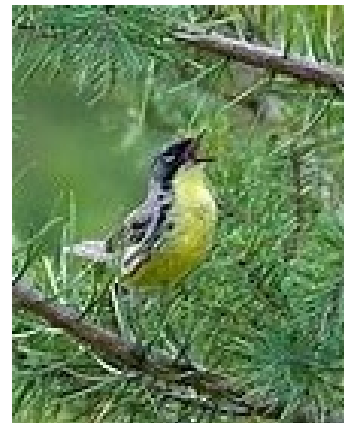
The Kirkland Warbler, a Watershed Native

The all volunteer PRVEL board is always open to input from members on how best to manage the watershed and is eager to welcome new members to board positions at the April 9 th meeting. Please consider joining in our conservation efforts and help us to manage the large area that makes up our beautiful watershed.