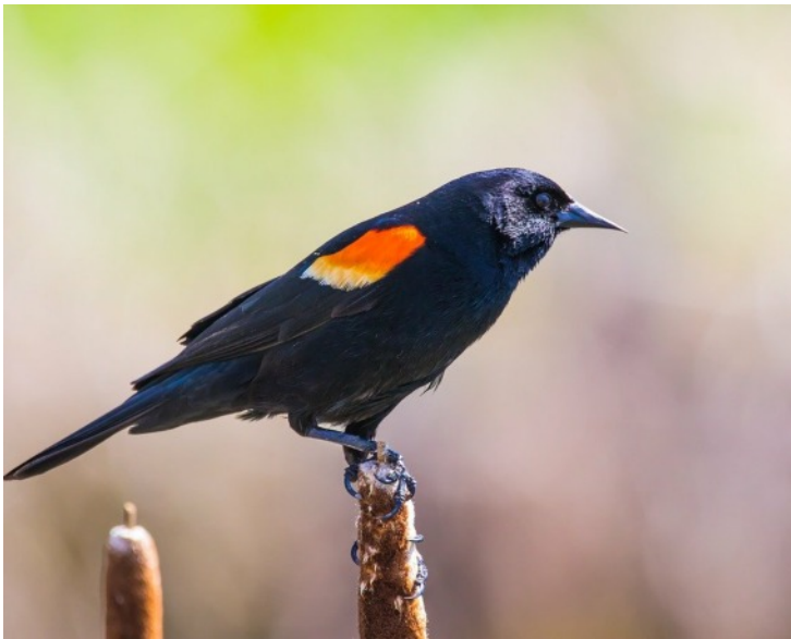
Red-winged Blackbird on a perch

Male red-winged blackbirds are easy to spot with glossy black bodies, red/yellow shoulder badges, and sharp, pointed bills. Females however, are not black, but rather dark brown in color with notable streaks highlighting their smaller shape. Habitat includes fresh and salt water marshes, along waterways and wet roadsides as well as drier meadows, crop fields, and pastures. They have been considered an agricultural pest by farmers in many areas and measures are taken to kill them off.