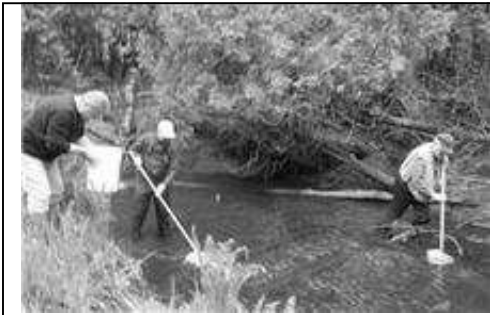
Volunteers search for "bugs" in the Pine River